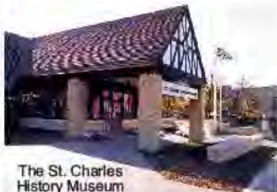
The St. Charles History Museum

215 E. Main Street • 630-584-6967 www.stcmuseum.org