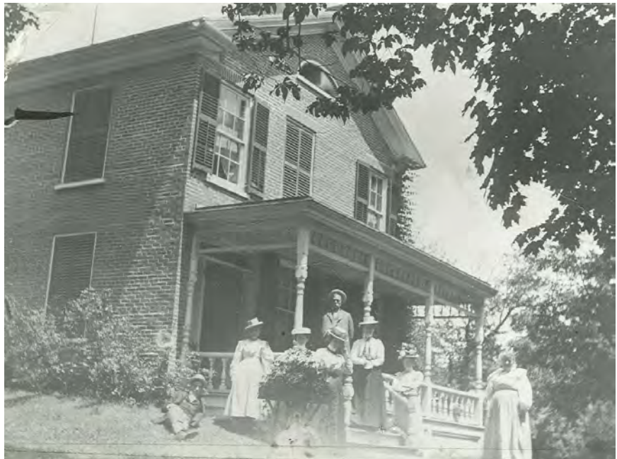
The Dunham-Hunt House circa, 1900.

Program dates and times are subject to change, please call to confirm all events (630) 584-6967