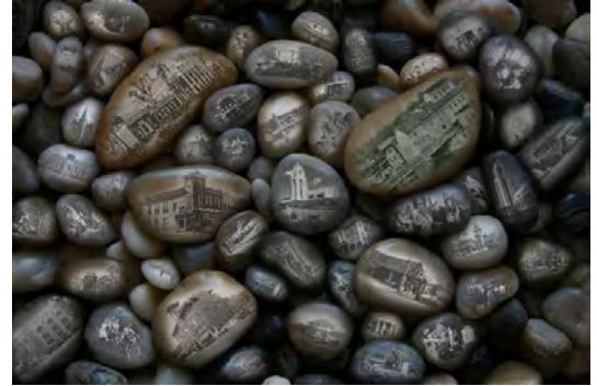
St. Charles History Rocks print